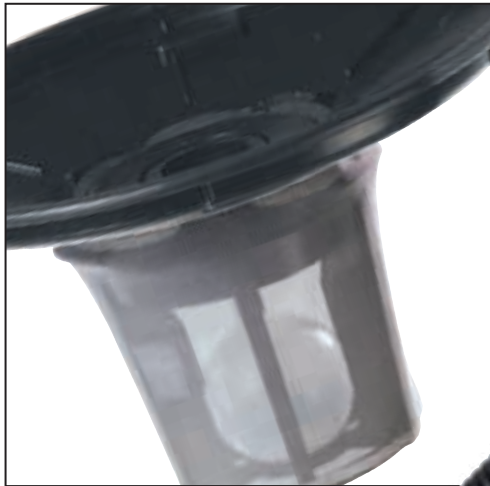
Safety Float Valve