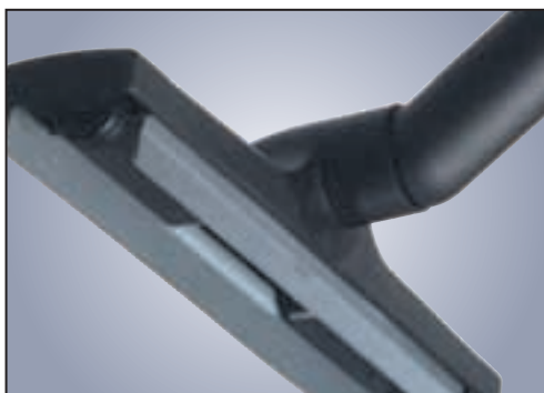
Wet Pick-Up Nozzle