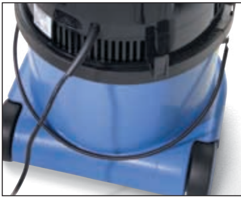
Pail-Style Emptying Handle