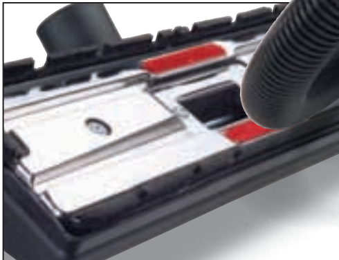
Stainless Brush Plate